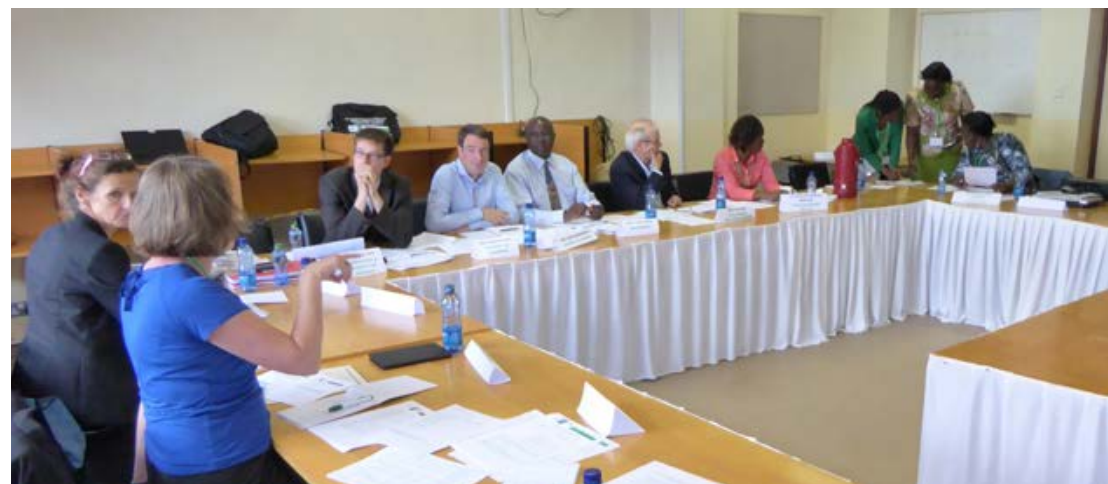
The steering group and DAAD representatives formed the selection committee during the DAAD CERM-ESA Master's and PhD scholarship interviews held at Moi University

The steering group will come together again in April 2016 during the 1 st CERM-ESA Summer School. If you have ideas or suggestions for CERM-ESA's way forward, please send them to one of the coordinators who will bring them to the steering group meeting to be discussed.