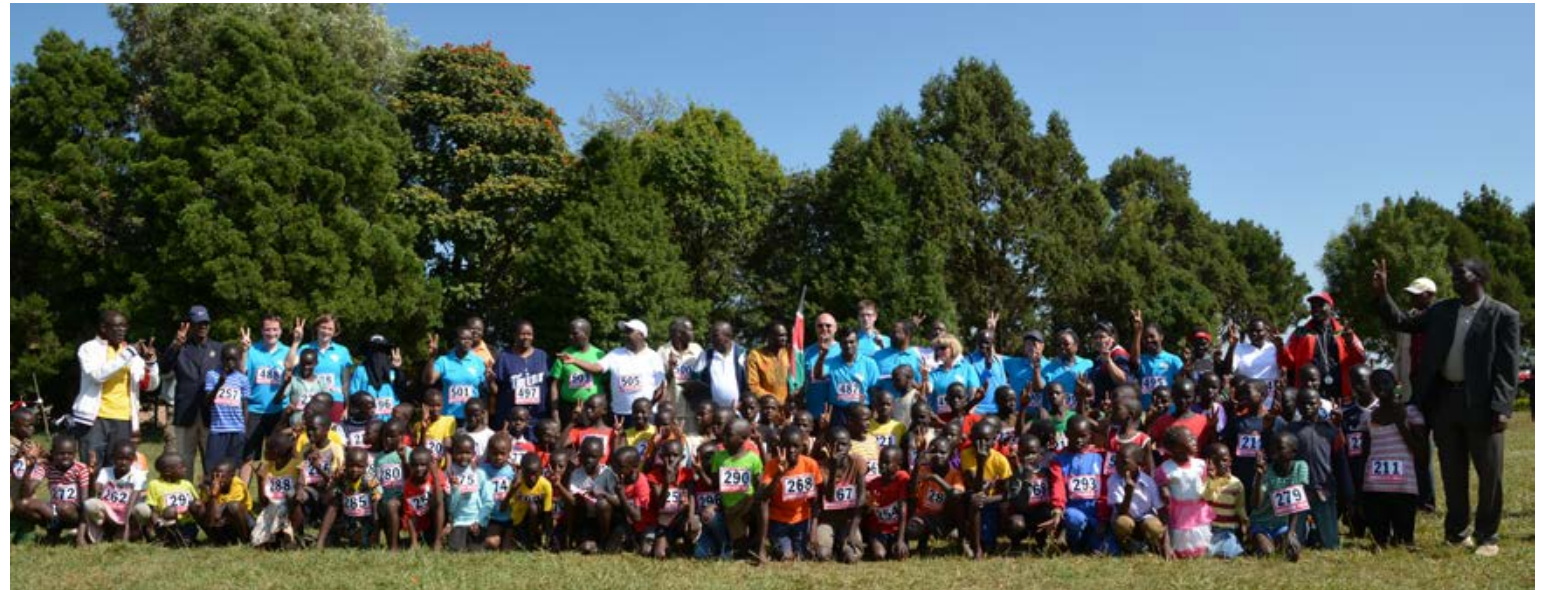
CERM-ESA staff from the five partner universities are clad in blue t-shirts and they share a picture with children from the Kesses Community