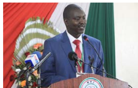
Uasin Gishu county Governor