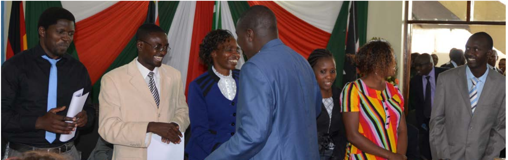
CERM-ESA scholarship holders receive their Letters of Award during the Opening Ceremony in September 2015