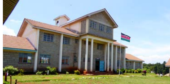
Vista: The Main Administrative block of Biwott Primary School

After a cup of tea and biscuits, prepared and served by the learners, we were taken for a tour of the school. The cleanliness and tidiness of the classrooms and school-grounds indicate the commitment and dedication of the staff, parents and learners. We were also shown the two newly built classrooms and laboratories which are in the process of being fitted. Despite the minimal resources at their disposal, the school has managed to do an amazing job.