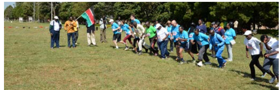
On your marks! CERM-ESA staff take on the first round of the race by corporate men and women