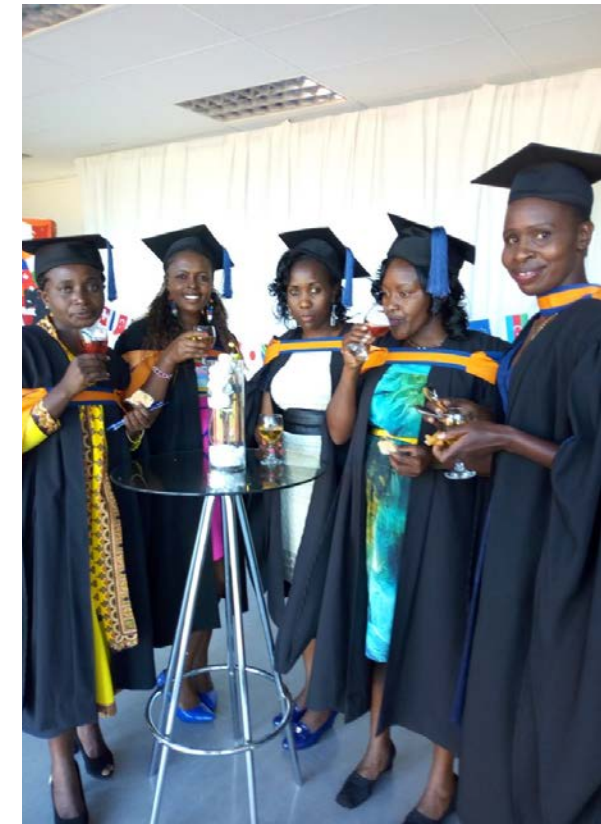
Celebrating their success: after the official ceremony, CERM-ESA team at NMU organized a graduation party for the scholarship holders

“The coming to an end of our master of education study journey gives us a new beginning and a start of another journey. As it’s said that when you climb a hill, you find there’s another hill ahead, we are focused to take the next step armed with the following important lessons for any scholar: Think about what you really want; Hang on and hold out for opportunities: Talk to people and turn up to public lectures and seminars, among others.”