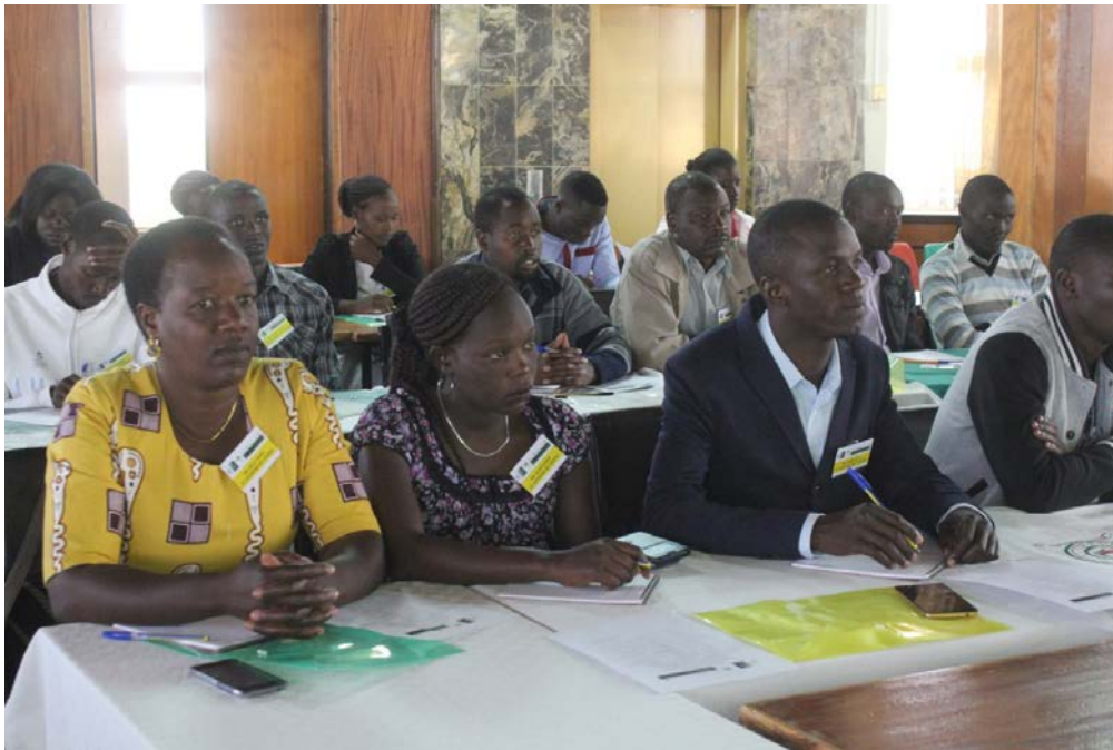
Teachers listening attentively during the opening session