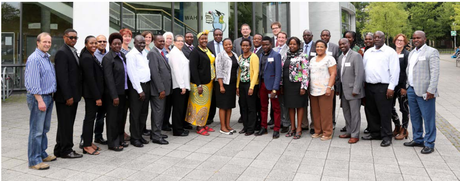
Participants of the Staff Development Programme 'Advancing Education Research and Research Management' at Oldenburg University

and support in East and South African Universities but there are also effective strategies and structures put in place by University leadership, deans' offices and research management that support researchers and young scientists and eventually increase the institutions' research output and research quality. After a week of intensive exchange and training on the topic, the participants left Oldenburg with a twofold homework: firstly, everyone was asked to identify a best practice example for research management/ support at their institution and explain it in detail so that it becomes replicable. Secondly, participants were asked to write a Project Action Plan (PAP) alone or in a small group where they plan and implement a small project in their own function that will – in whatever small way – advance research at their institution. We are looking forward to the reports, experiences and reflections when meeting again for the second on-site phase at Moi University in February 2018!