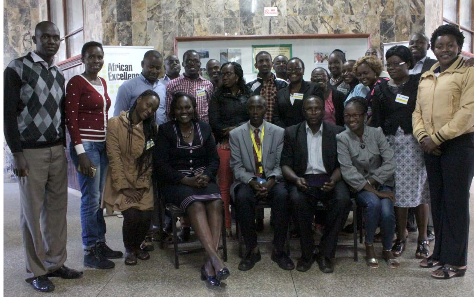
Workshop participants and facilitators at the Centre