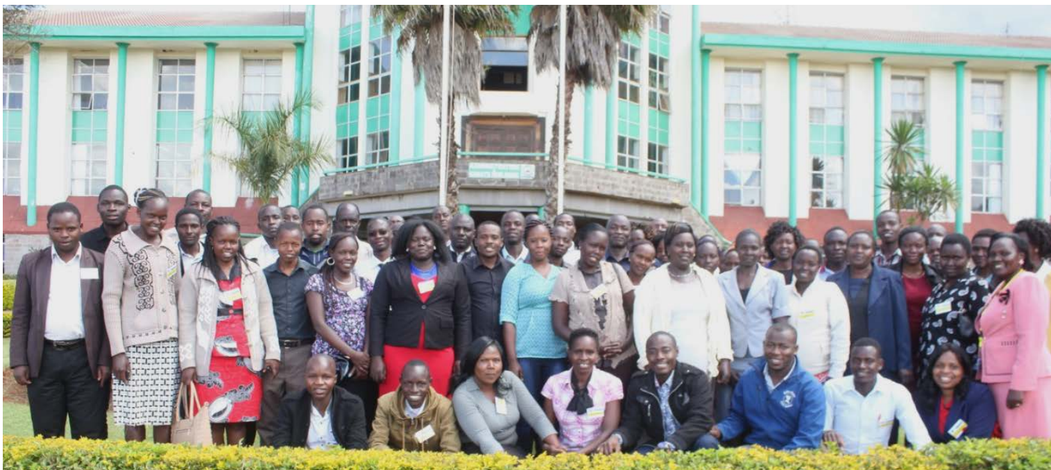
Participants of the CERM-ESA In-Service Teacher Training Workshop 2017

During the month of November, the Centre hosted a Secondary School Teachers Workshop with the Theme "TEACHERS INSTRUCTIONAL EFFICACY". This was in line with the partnership, support and capacity building goal of the Centre.